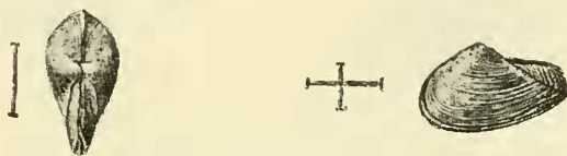
FIG. 2.— Corbula chilkaensis , sp. nov.

Shell thin, greyish white, concentrically striate, posteriorly rostrate where it is covered by a blackish, foliaceous periostracum; umboes rather large, but not very prominent, situate one behind the other, a keel descending from these in a posterior direction; right valve somewhat sinuous, especially posteriorly; dorsal